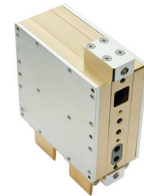
Power scaling with 1 kW modules

The robust system comes with an integrated cooling unit enabling the use of standard industrial tap water. As all ROFIN Macro products, the DF laser meets state-of-the-art industrial quality and safety standards.